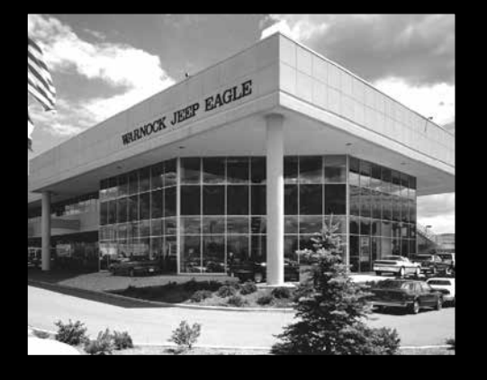
Flush Glazing, Pressure Wall, Division Bar, Tubes, Angles, Channels, Bars, Sheets & Panels