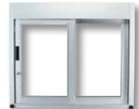
Single Slide with Clear Finish (left-to-right)