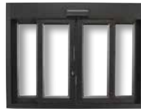
Bi-Parting Slide with Bronze Anodized Finish