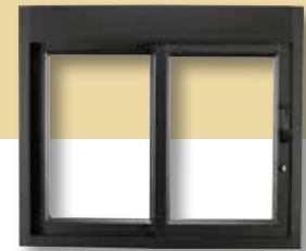
Single Slide with Bronze Anodized Finish (right-to-left)

All ASPECT pass-through windows are fully assembled in the United States and are ready for quick and easy installation.